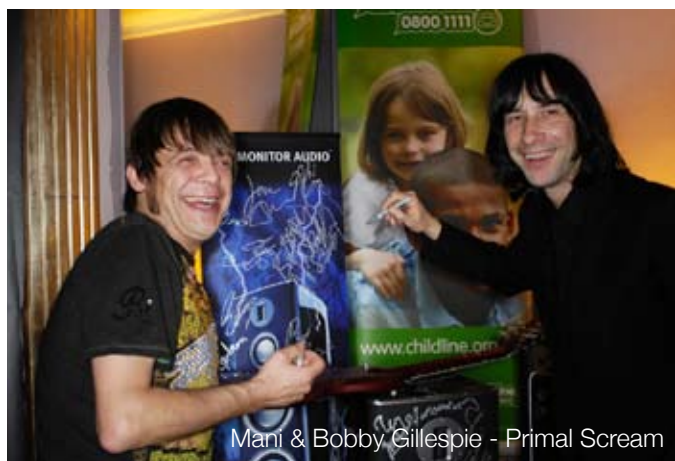
Mani & Bobby Gillespie - Primal Scream